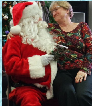
Our Music director