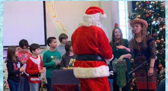
"Hey, Santa, I was a better girl than that!"