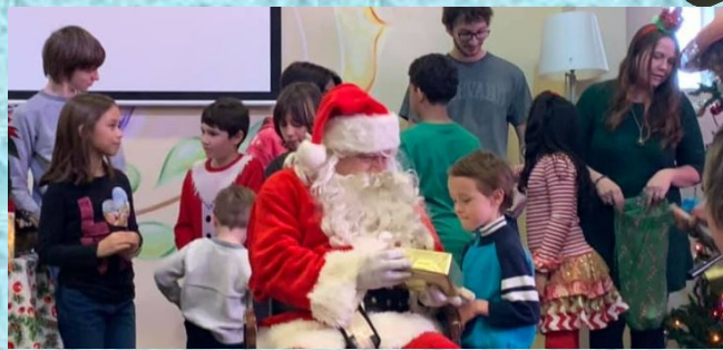
Santa passing out presents