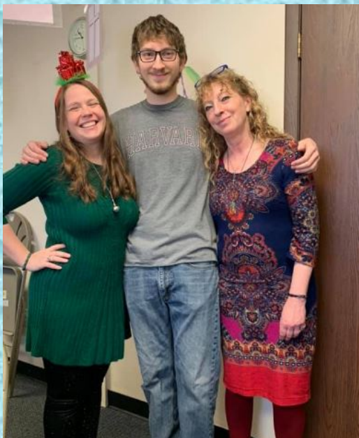
Directors and playwright